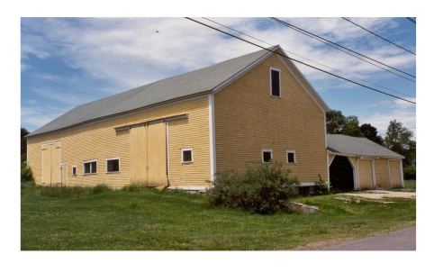
The Rolfe Barn, Penacook (Concord), NH

The historic Rolfe property lies in that half of Penacook Village that is part of Concord. Nearly two years ago, Concord passed a demolition review ordinance that calls for public notification whenever removal of a historic building is proposed in the city. As this review was triggered, neighbors were shocked to discover a threat to a structure that had stood as a reassuring landmark to